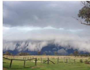
Winds of change— awesome cloud formation from a recent storm.