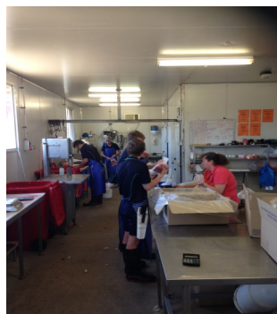
The team at Bannock Brae hard at work....

always we appreciate your patience and understanding at this busy time as we are pushed to the limit. We also recommend getting your orders in sooner rather than later to avoid disappointment. This especially applies to our tradition woodsmoked hams which are extremely popular at Christmas. There is limit to how many we can smoke and we do sell out every year—Orders are being taken now—simply phone through your order on 46 967 062 or drop