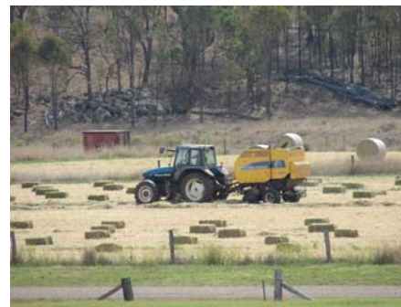
Making hay while the sun shines!

The happy hens at Bannock Brae have experienced a population explosion, with 24 new chickens hatching in an extraordinary way. Our two crazy turkeys have been sitting on eggs, carefully incubating the new chickens. All have survived and thrived and there's more due soon! Ellie, our new working dog, continues to amaze us. Despite only having 3 legs she works cattle all day, is as fast as any other dog and she is just so clever.