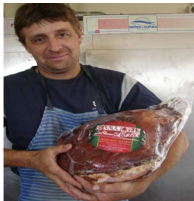
Ham time again!!!