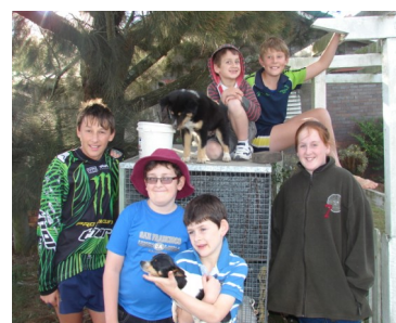
City kids meet Country kids!!